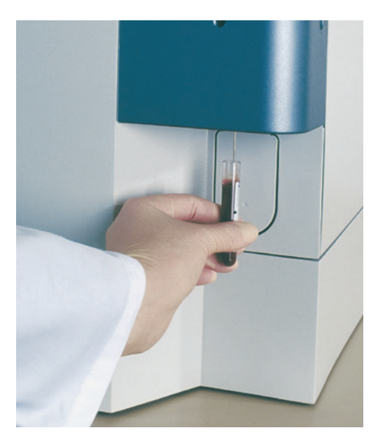
Fig. 4 In the XS-800i, blood samples can only be analysed manually and in open condition which is advantageous especially for minimal blood volumes.