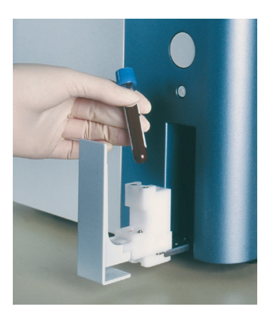
Fig. 3 In the XS-1000i, the tube cap can be pierced to minimize the risk of direct contact with the sample.